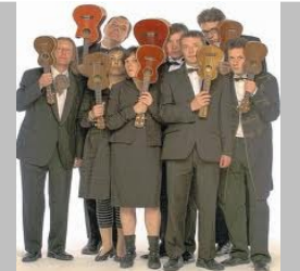
The Ukulele Orchestra